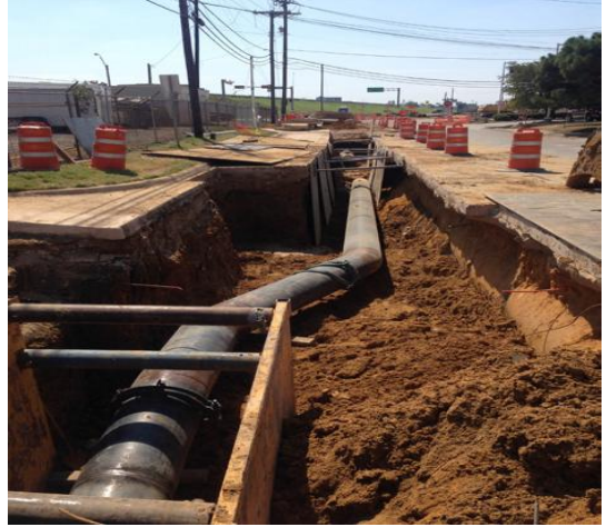
Fig. 1. A Typical Pipeline